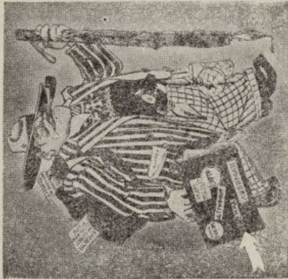
Here is reproduced the Krokodil cartoon as it appeared in Newsweek. Observe that the "Andre" has been blocked out, and only the "Zhid" is visible.