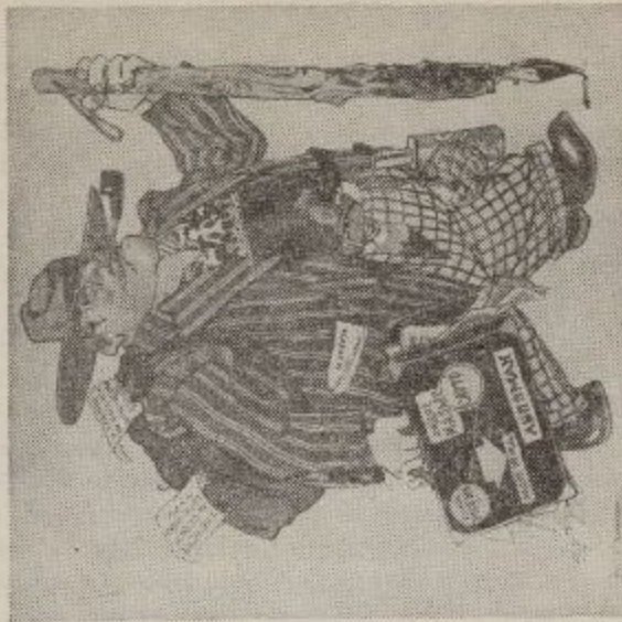
This reproduction is from the original as it appeared in the March 20 issue of Krokodil. The arrow clearly shows the name "Andre Zhid," which is the Russian transliteration for Andre Gide, French writer.

anti-Semitic campaign. On April 20th, Schwartz wrote, "Meanwhile observers of the Soviet press have noted that the cartoon campaign against 'cosmopolitanism' in Krokodil , the lavishly illustrated Soviet humor publication, has been marked by the use of hooked noses on the figures used to represent 'cosmopolitanism.' One cartoon on the front page of Krokodil juxtaposes the name Lippman — which is usually Jewish in the Soviet Union — with the word 'Zhid,' a derisive Russian term for Jews used by Russian-speaking anti-Semites."